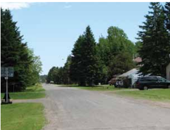
Rosslyn Village near Municipal wellhead

The Source Protection Authority made up of the same Municipal representatives as the Lakehead Region Conservation Authority Board has continued to provide support for the planning process. Both groups worked together to meet the tight deadlines associated with the legislated process.