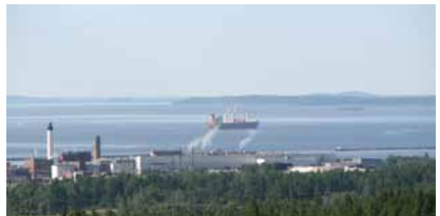
Thunder Bay's North Harbour on Lake Superior

The plan will provide residents in the Lakehead Source Protection Area who are on one of the two identified Municipal drinking systems with the reasonable expectation that the source water that feeds their taps will be clean and safe. However, protecting source water is only the first step in a multi-barrier approach aimed at ensuring safe, clean drinking water for all Ontarians.